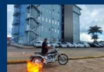
Motorbikes Event in Suriname